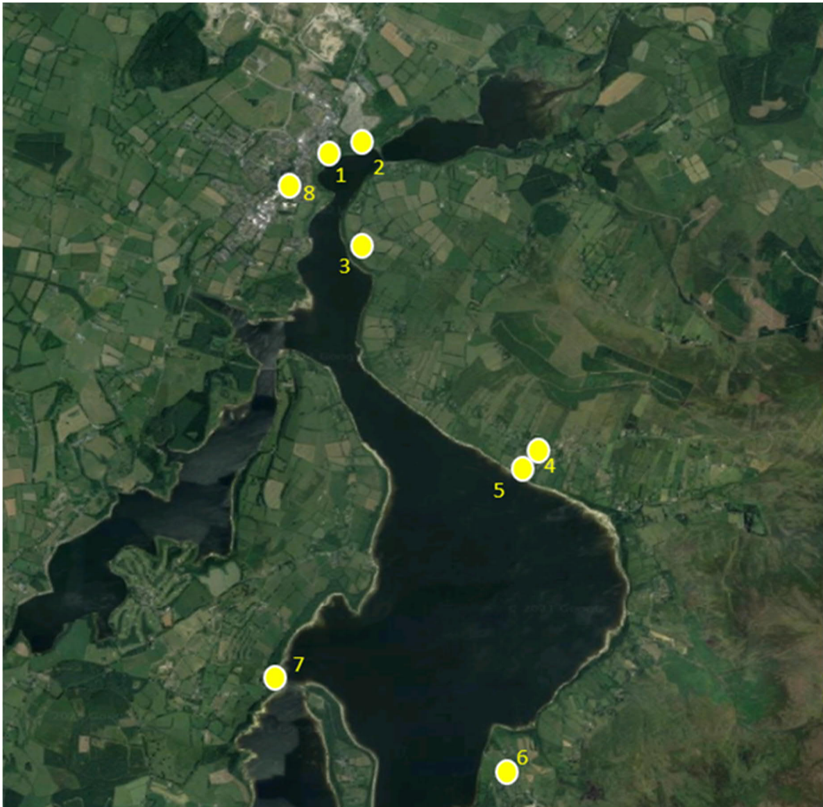
Figure 2 Traffic Survey Locations